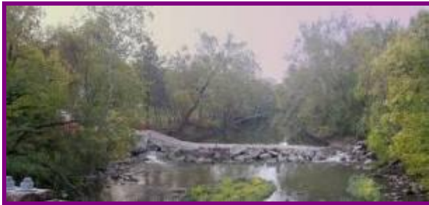
The photos show the Wolf Creek Park lowhead dam on the Alum Creek before , during and after demolition and removal.