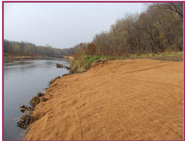
Photos Before (above left) and after (above right) of severely eroding streambank stabilized by work completed under this grant. Previous 319 funds allowed for restoration of exposed floodplains following removal of the Munroe Falls Dam in 2006.