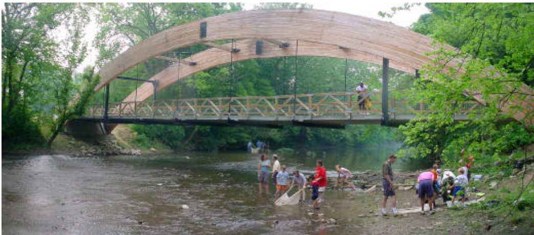
FACT Creek Walk at Strawberry Farms in July 2005.