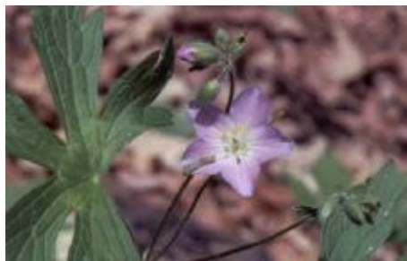
Wild Geranium in bloom

May 13 th FACT meeting and Speaker Series , Inniswood Metro Gardens, 6:30 – 8:00 PM