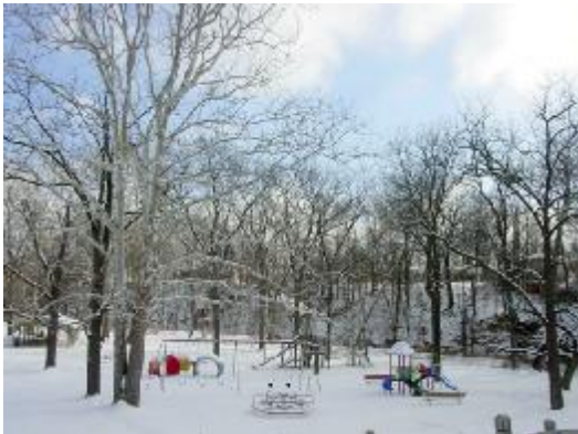
Playground along Spring Run in Blendon Township

Spring Run is a relatively large stream as far as Alum Creek tributaries go. It follows a seven mile course through southern Delaware County (Genoa Township), Westerville, and Blendon Township in Franklin County before entering Alum Creek near State Route 161.