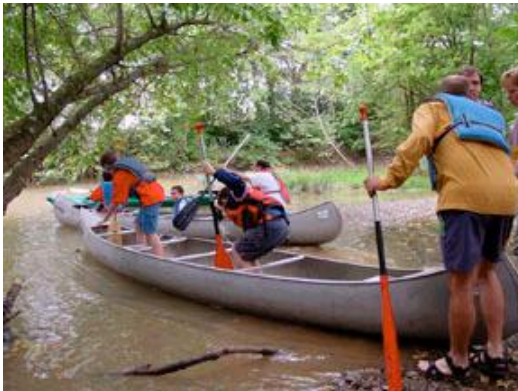
Canoeing at Alum Creek River Fest 2002