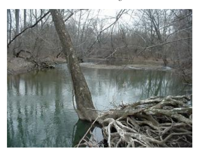
Alum Creek at Cherrington Park

Otterbein College Rike Center: From Columbus, north on Route 3 (State St) towards Westerville. Left on West Main Street. Right on Center Street, which dead-ends into the Rike Center. Cherrington Park: From Columbus, north on Route 3 (State St) towards Westerville. Left on Hiawatha Road, which dead-ends into Cherrington Park.